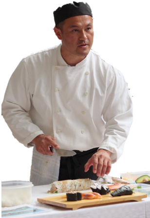
Photo Quiz Buffet Dinner Shamisen Performance